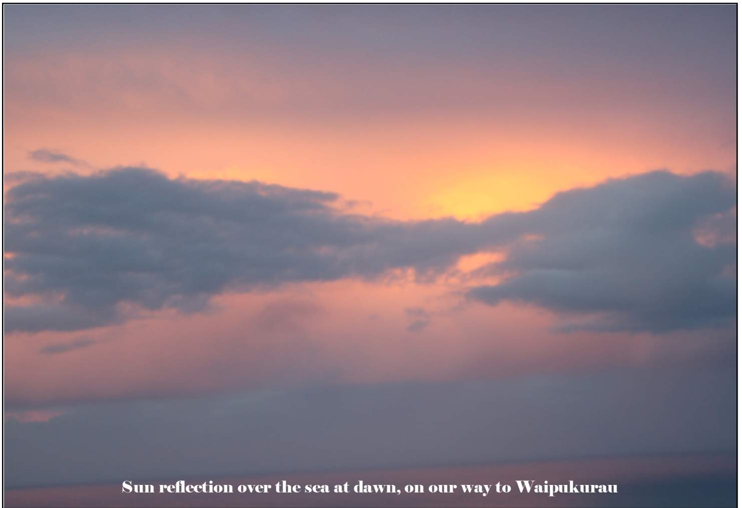
Sun reflection over the sea at dawn, on our way to Waipukurau