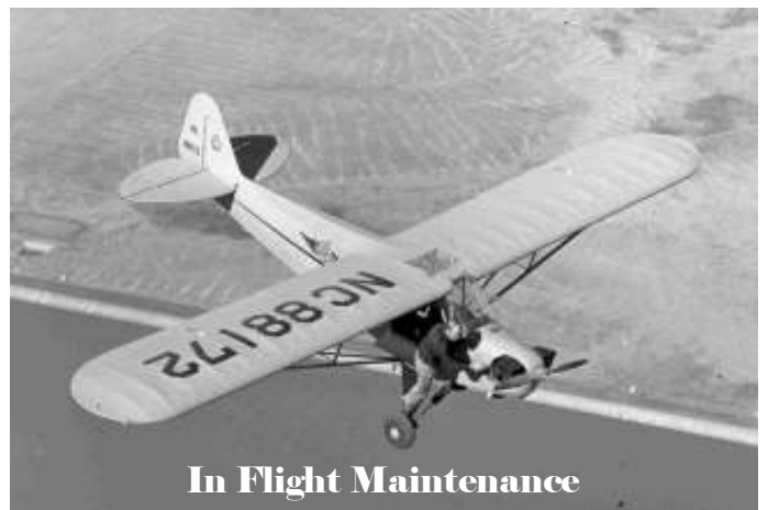
In Flight Maintenance