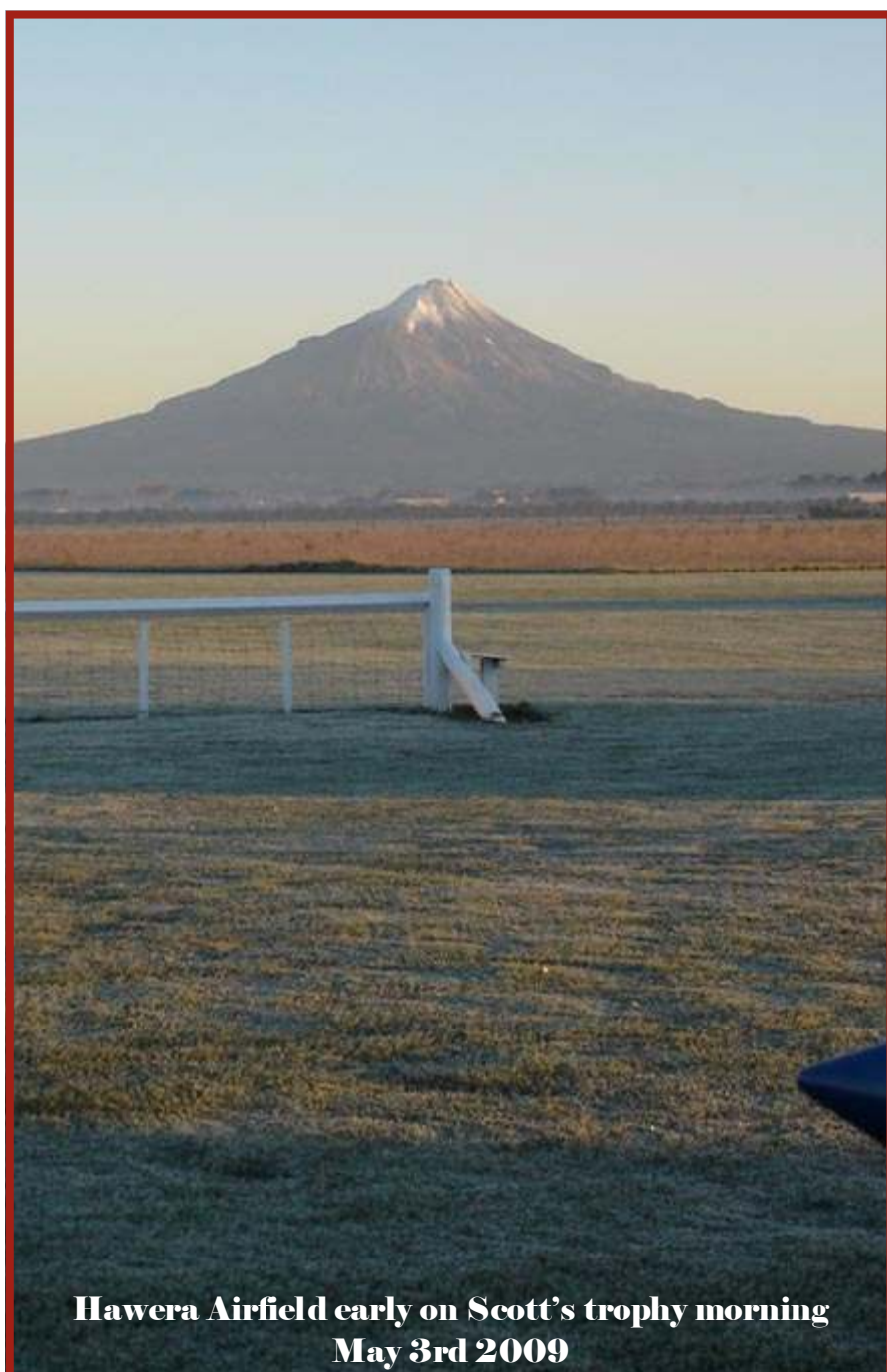
Hawera Airfield early on Scott's trophy morning May 3rd 2009