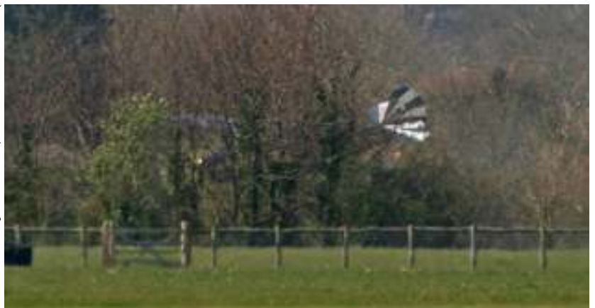
Lucky escape: The £50,000 plane flew for around 200 metres before crashing into trees on the edge of Goodwood airfield. If it had cleared the trees, the aircraft was heading towards nearby Chichester