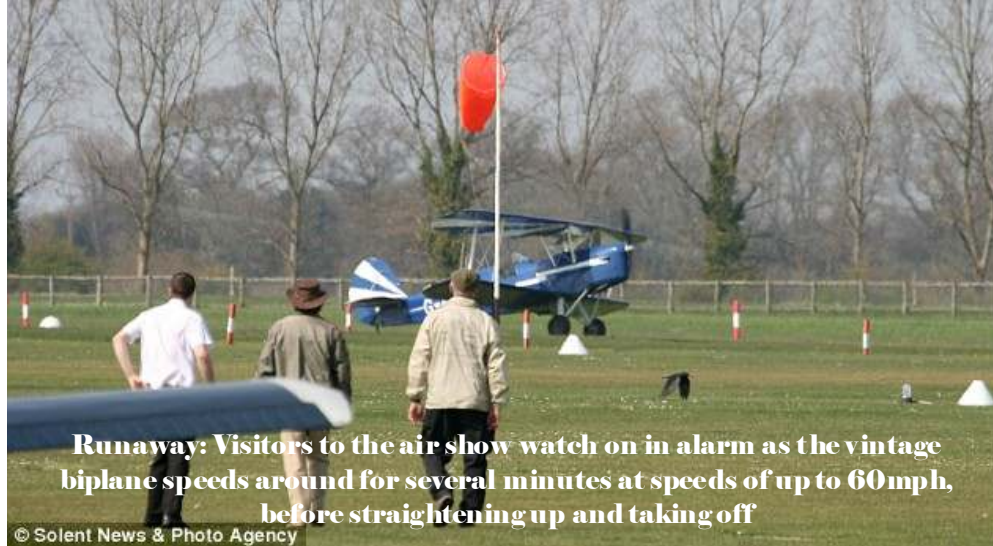
Runaway: Visitors to the air show watch on in alarm as the vintage biplane speeds around for several minutes at speeds of up to 60mph, before straightening up and taking off

Terrified onlookers saw the £50,000 plane 'run amok' on the airfield after it was started without a pilot in the cockpit.