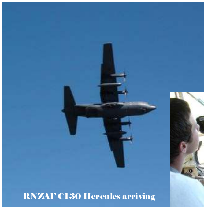
RNZAF C130 Hercules arriving