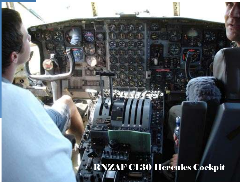
RNZAF C130 Hercules Cockpit

Waipukurau is a grass strip and 1055 meters in length so I was surprised to see the Citation Mustang there as I had only seen it operating on the seal. But I was even more surprised to see the RNZAF C130 Hercules arrive and land on the field and park up at the end so that every one could