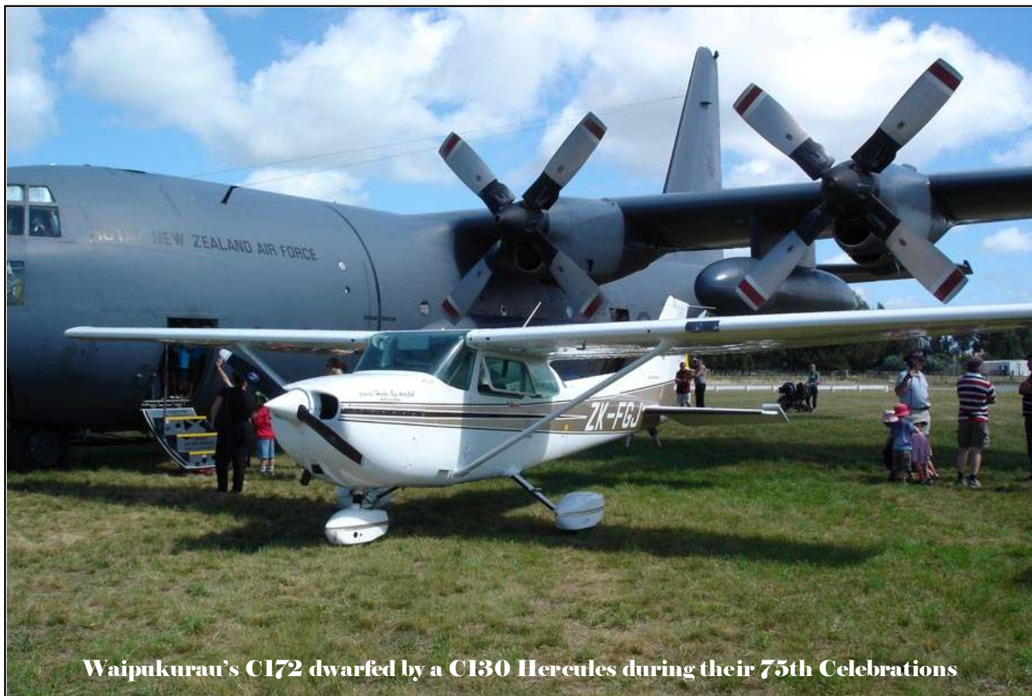
Waipukurau's C172 dwarfed by a C130 Hercules during their 75th Celebrations